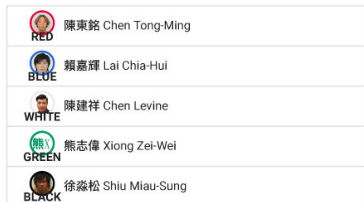
Men's Longboard PRO : Round 1 : Heat 2