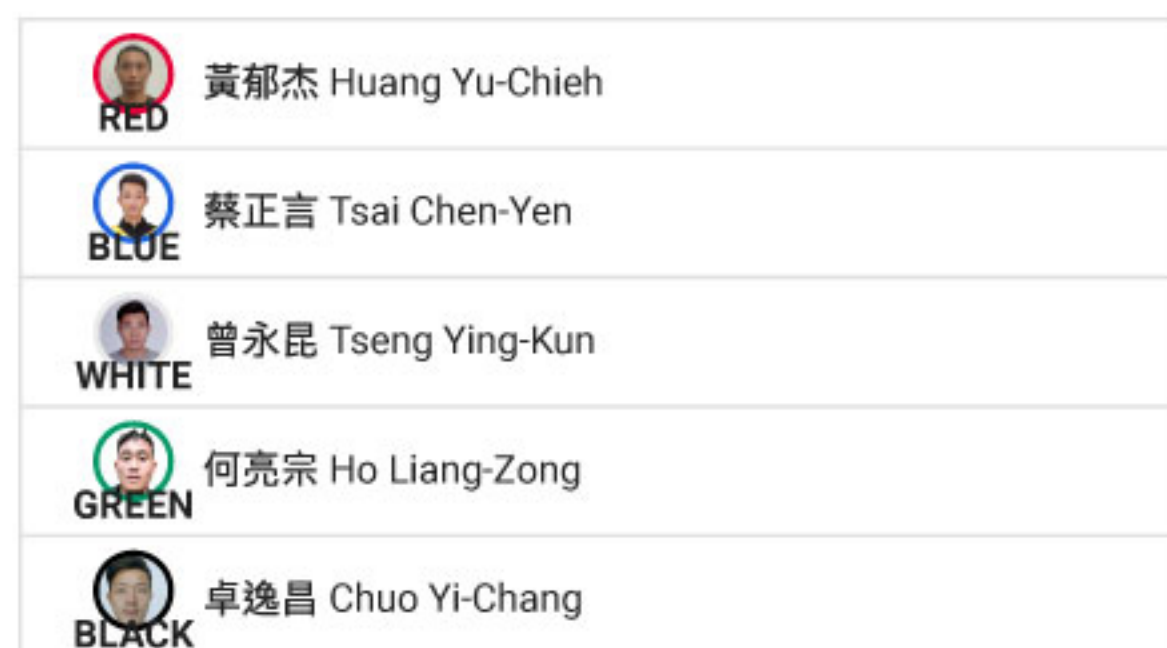
Men's Shortboard PRO/AM : Round 1 : Heat 2