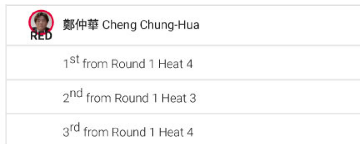
Men's Longboard PRO : Round 2 : Heat 3