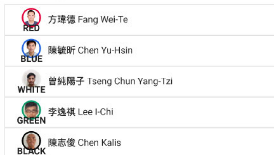
Men's Longboard AM : Round 1 : Heat 3