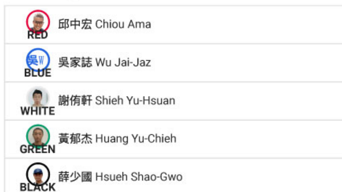
Men's Longboard PRO : Round 1 : Heat 2