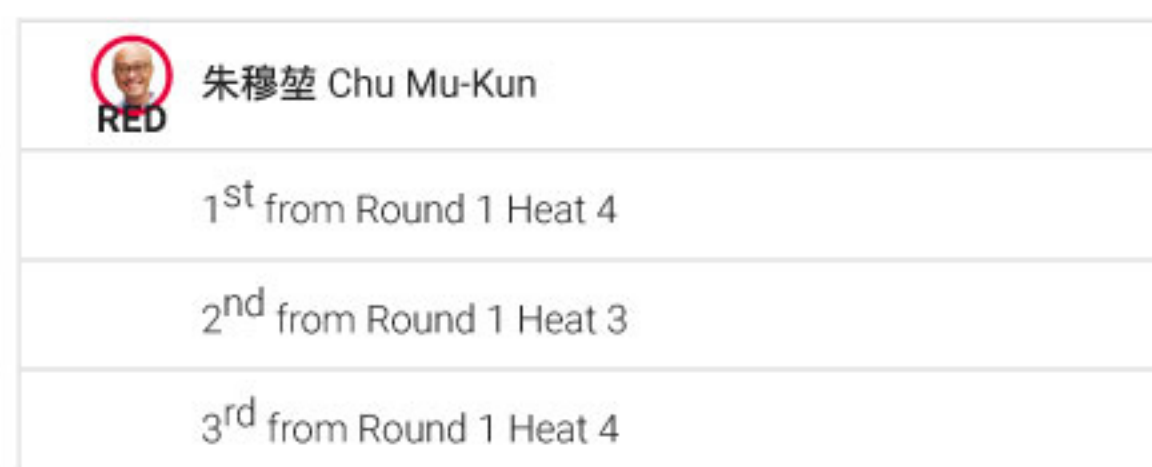
Men's Longboard AM : Round 2 : Heat 3