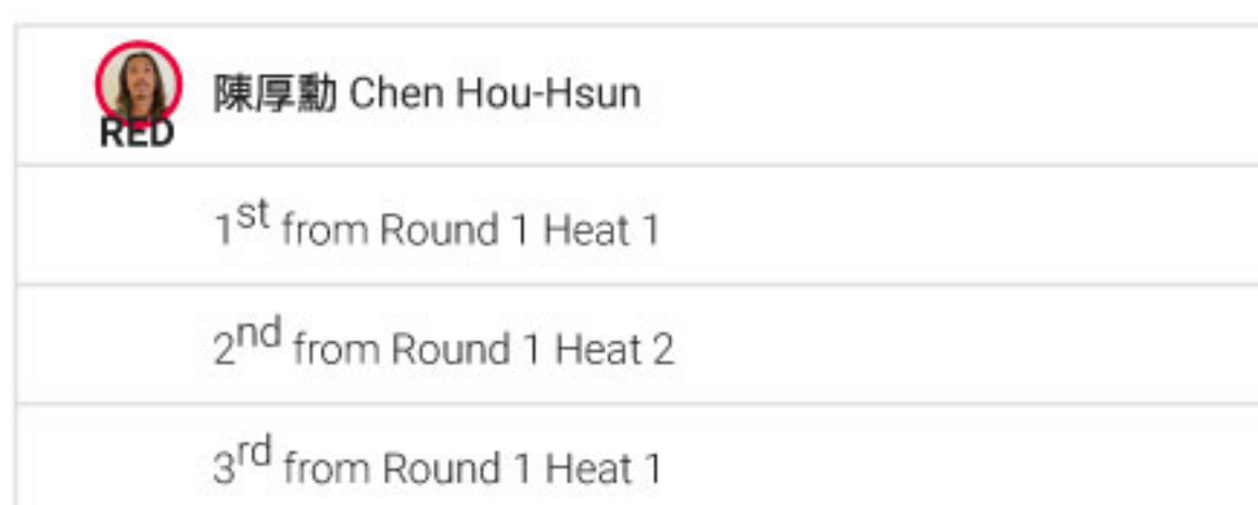
Men's Shortboard PRO/AM : Round 2 : Heat 2