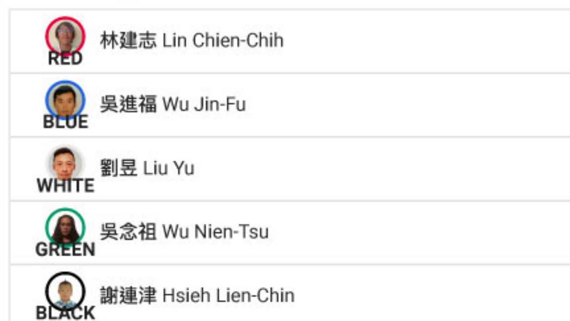
Men's Longboard PRO : Round 1 : Heat 3