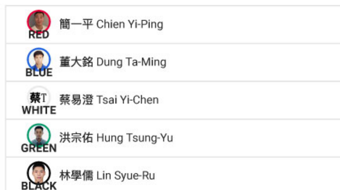
Men's Shortboard PRO/AM : Round 1 : Heat 3