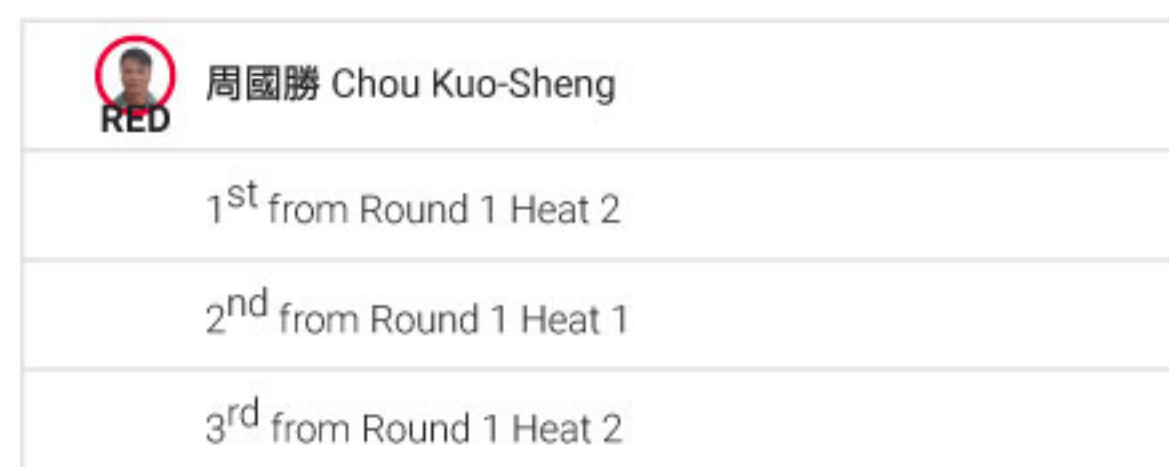
Men's Longboard AM : Round 2 : Heat 1