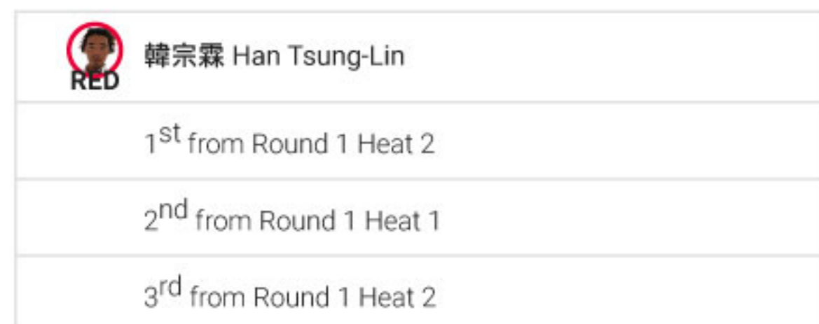
Men's Longboard PRO : Round 2 : Heat 1