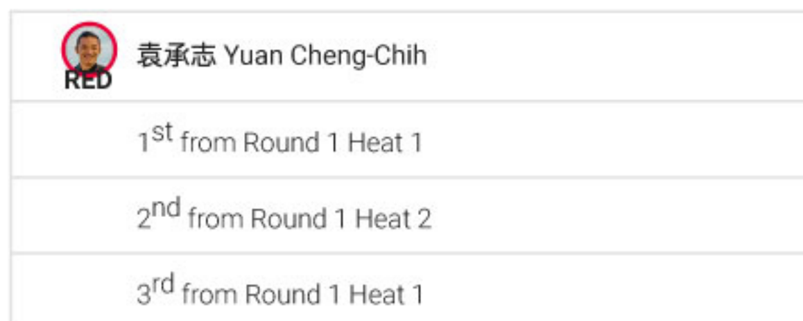
Men's Longboard PRO : Round 2 : Heat 2