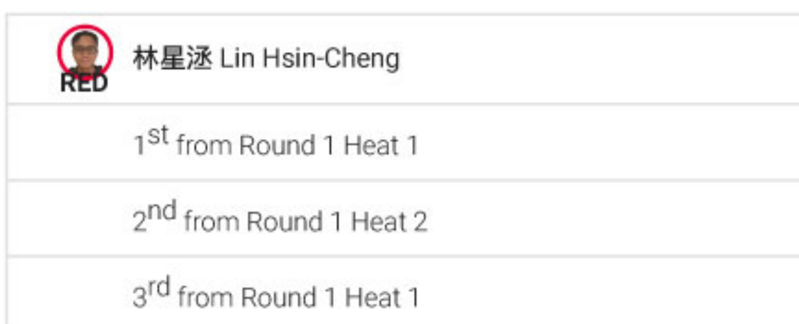
Men's Longboard AM : Round 2 : Heat 2