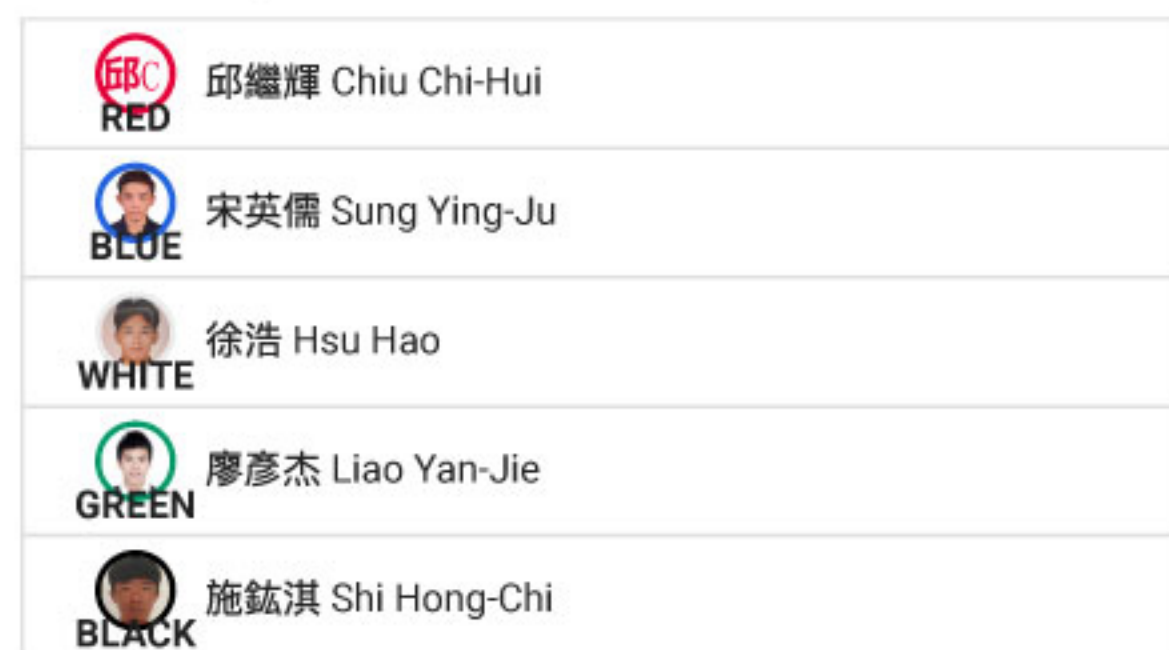
Men's Longboard AM : Round 1 : Heat 2