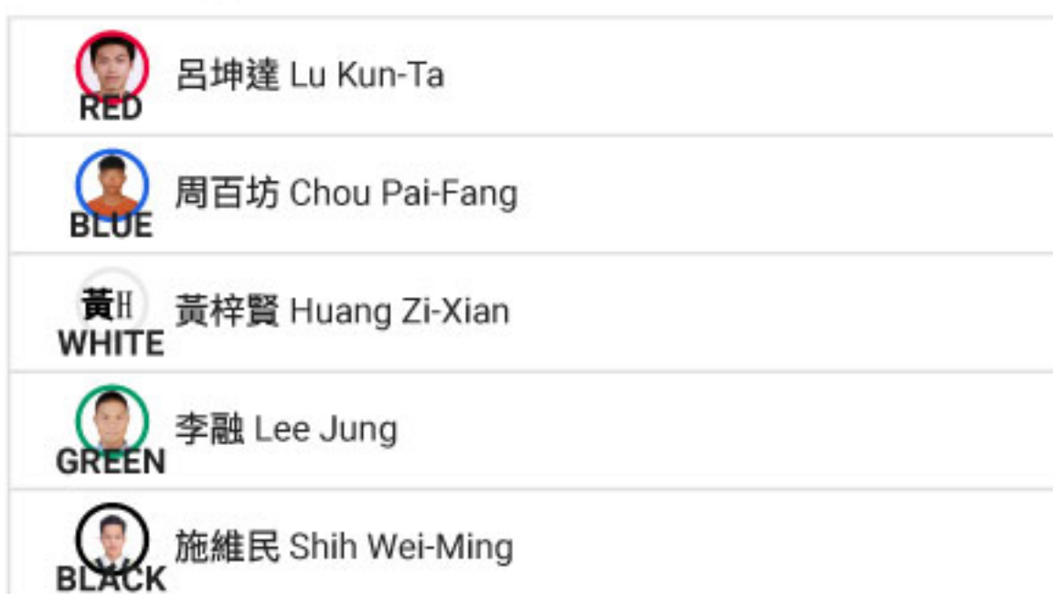
Men's Longboard AM : Round 1 : Heat 2