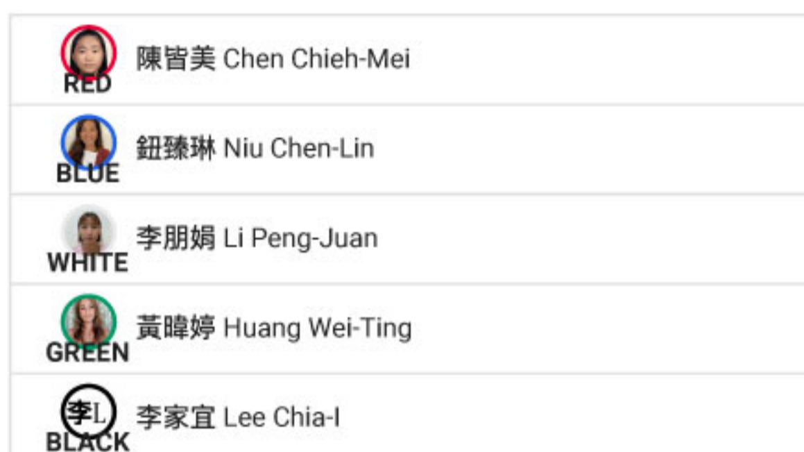
Women's Longboard PRO/AM : Round 1 : Heat 2