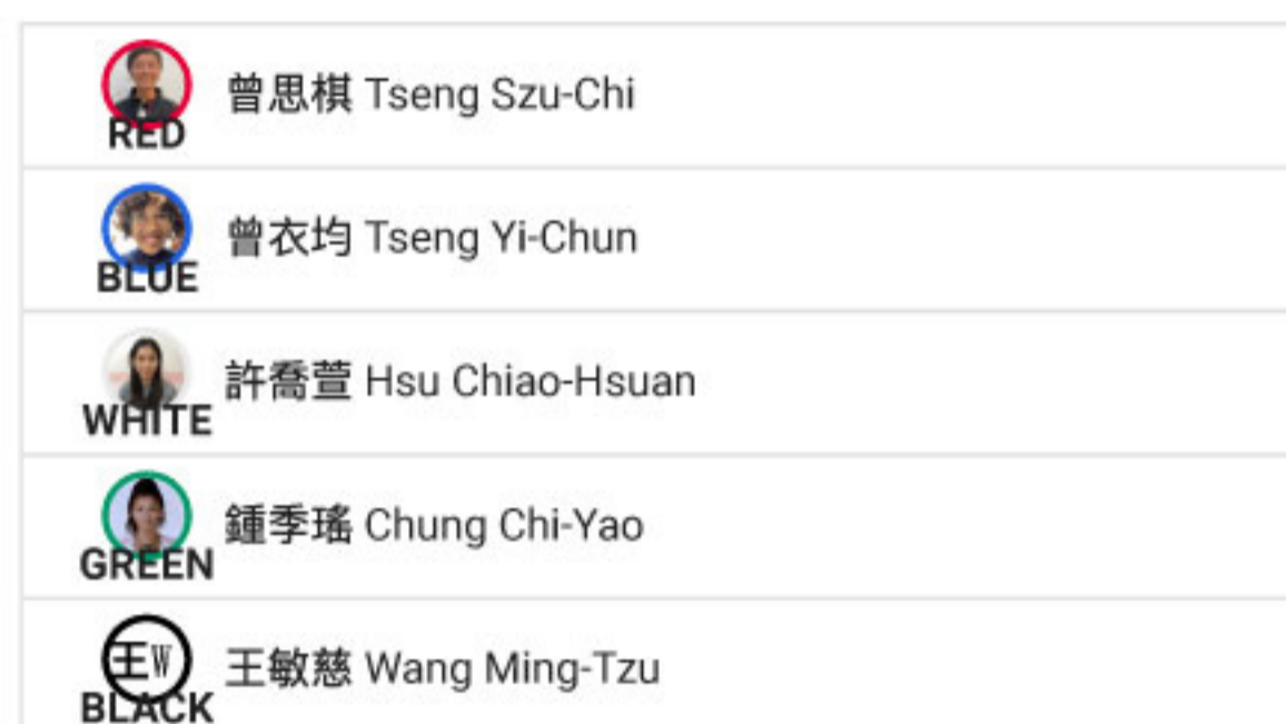
Women's Longboard PRO/AM : Round 1 : Heat 3