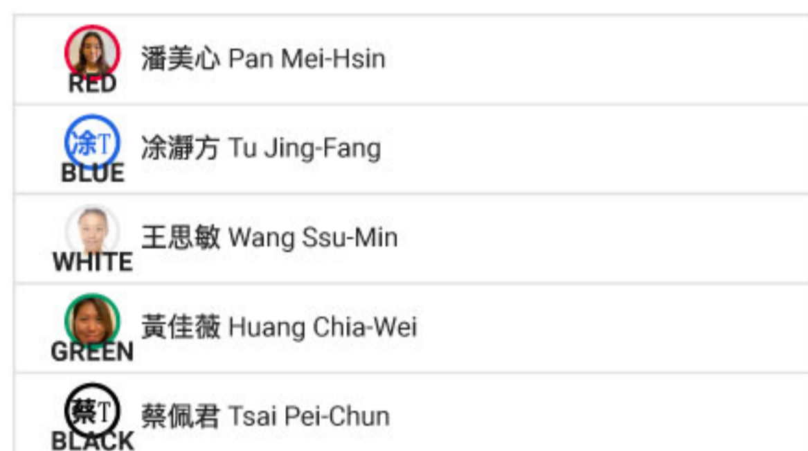
Women's Longboard PRO/AM : Round 1 : Heat 2