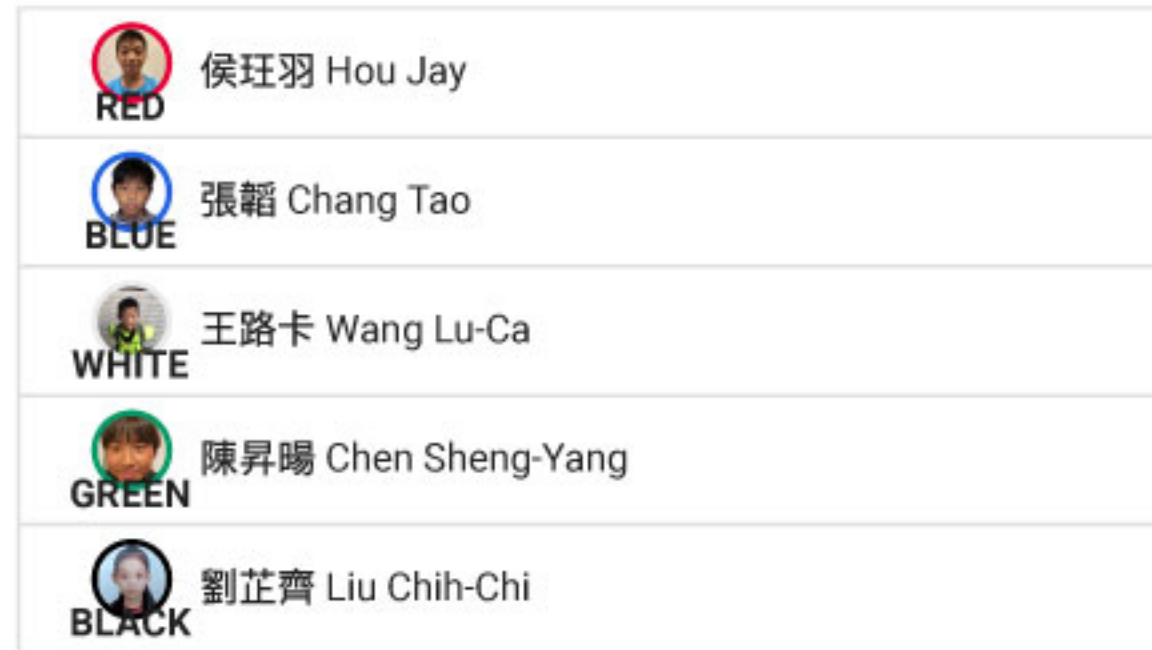
Super Boys & Girls (U15) : R1 : Heat 2