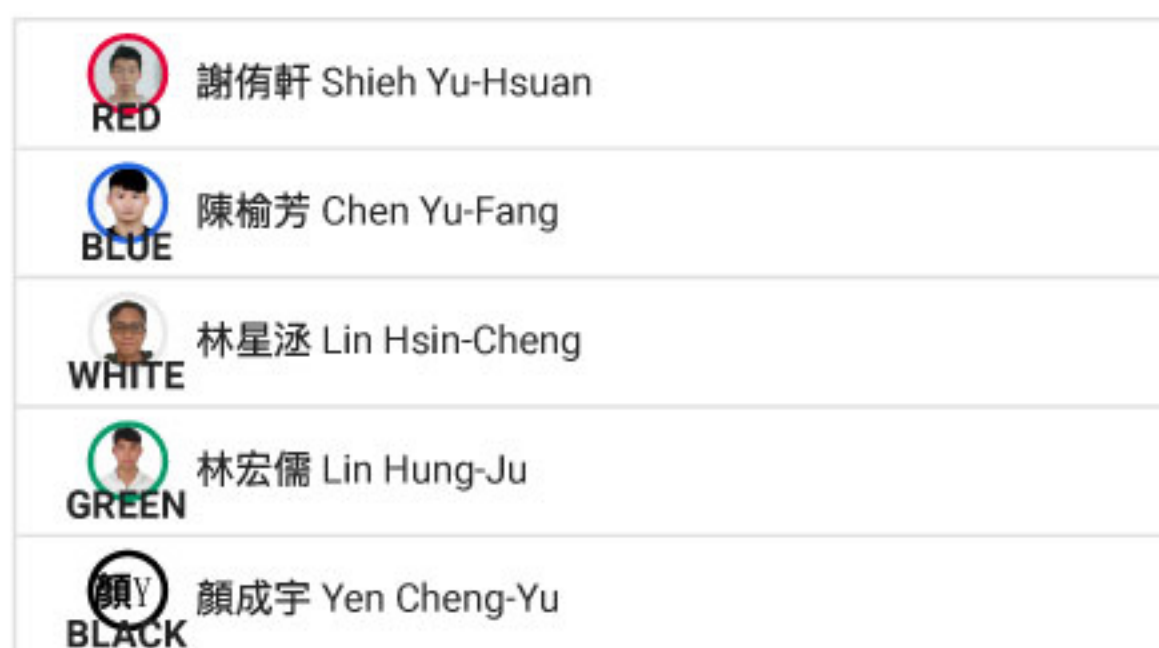
Men's Shortboard PRO/AM : Round 1 : Heat 2