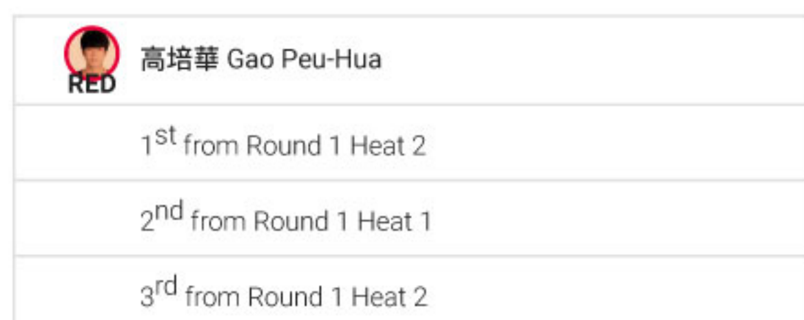
Men's Shortboard PRO/AM : Round 2 : Heat 1