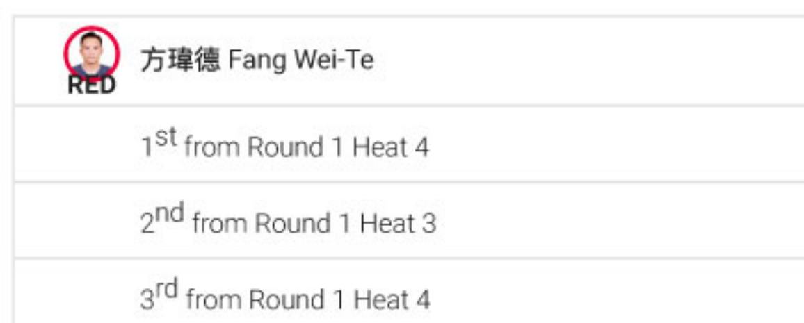
Men's Shortboard PRO/AM : Round 2 : Heat 3